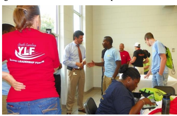
YLF Participants exchange ideas during their annual event.

South Carolina focuses on four priority areas: Community Supports, Employment, Health and Quality Assurance/Self-Advocacy . Each area addresses specific needs as outlined in the Developmental Disabilities Council State Plan. The plan is developed by the council and grants are funded based on specified criteria.